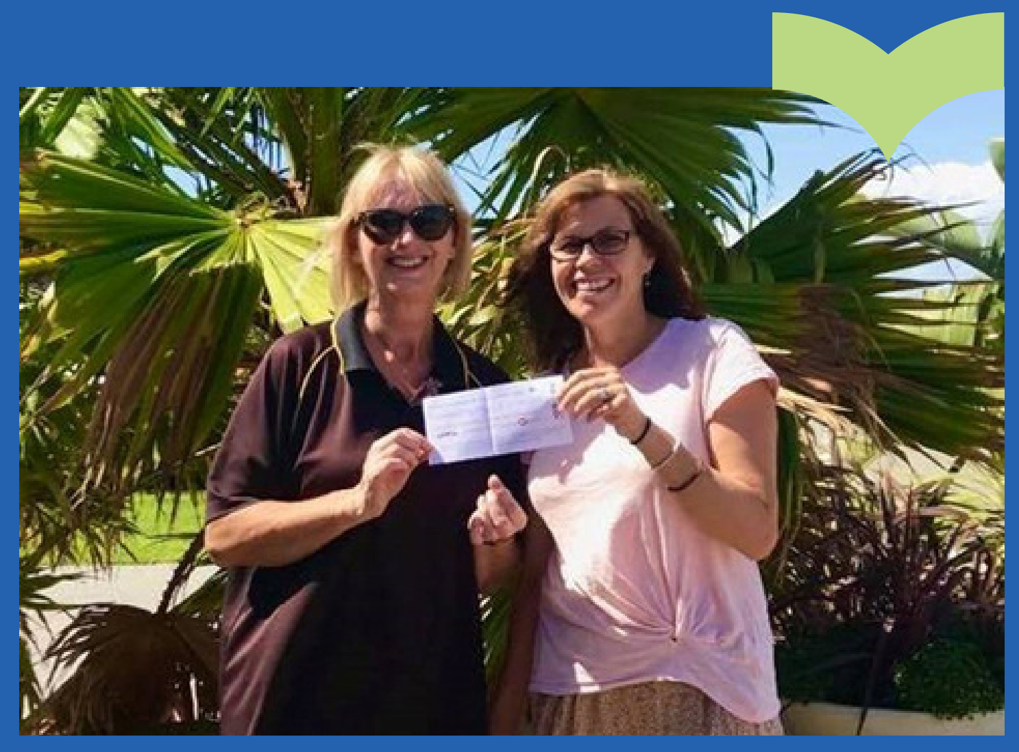
Street Mates Mandurah

Other initiatives we have run as a community are clean-up events, Easter Egg hunts, movie in the park, Halloween disco, kids colouring competition (popular during COVID) and ANZAC poppy making.