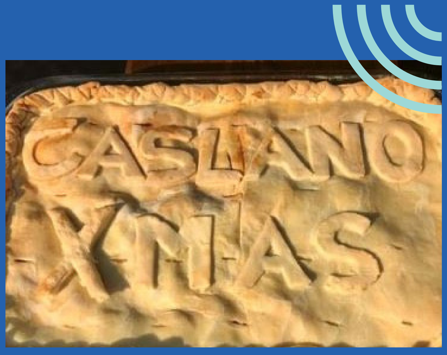
Street Mates Mandurah