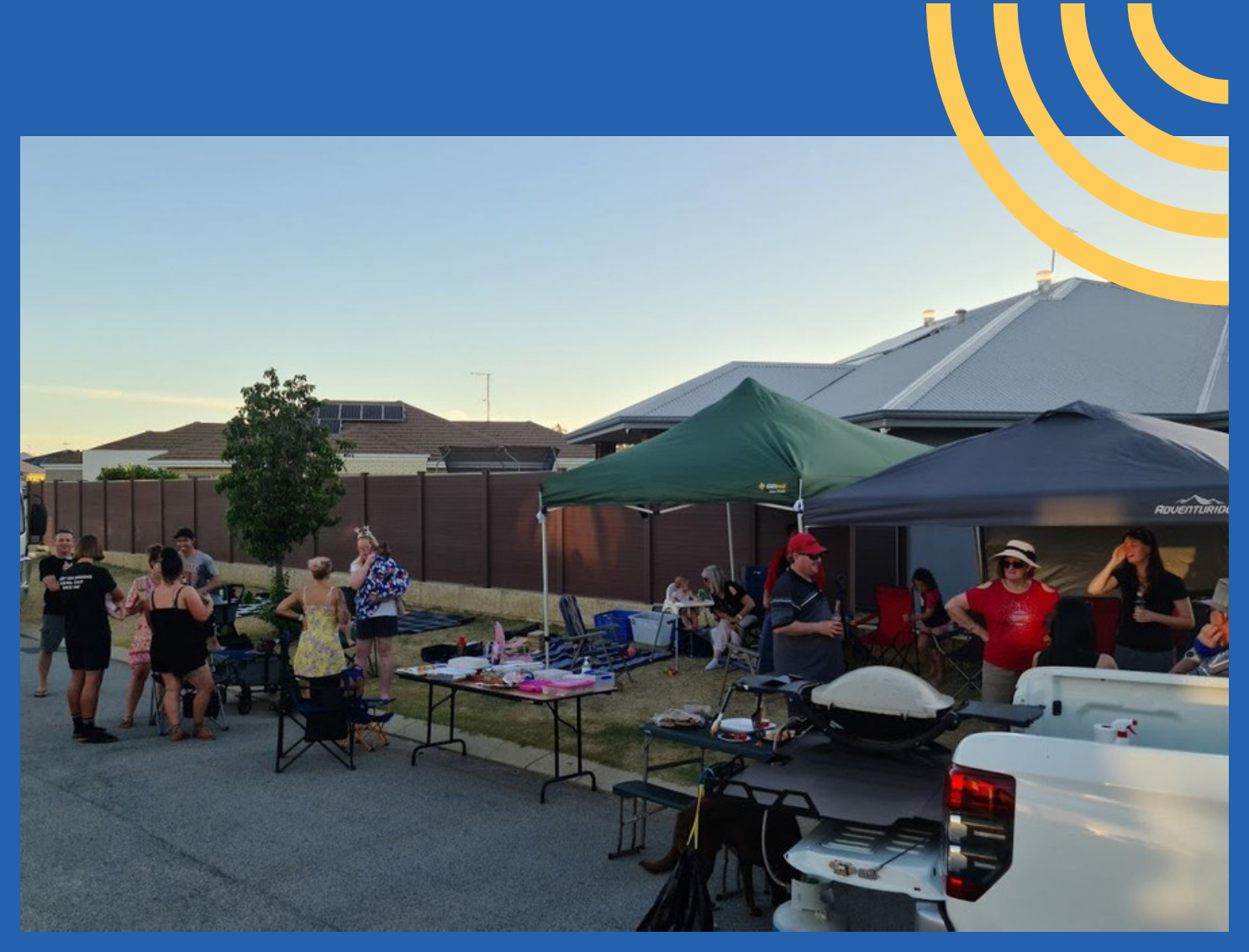
Street Mates Mandurah