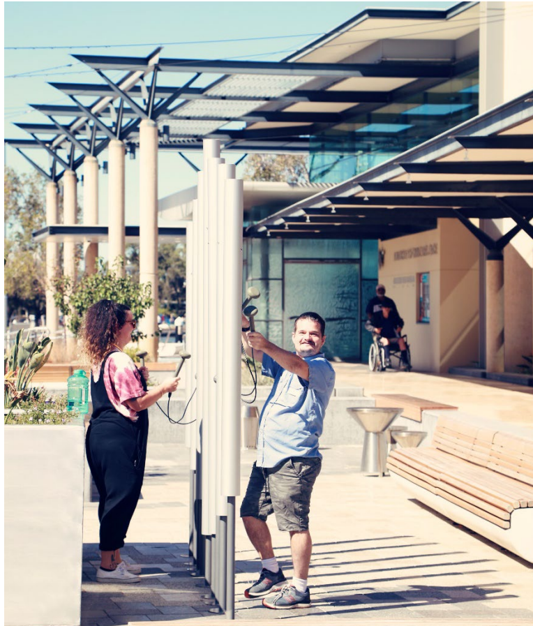
This is a photo of the area where people can sit out the front of the ManPAC.