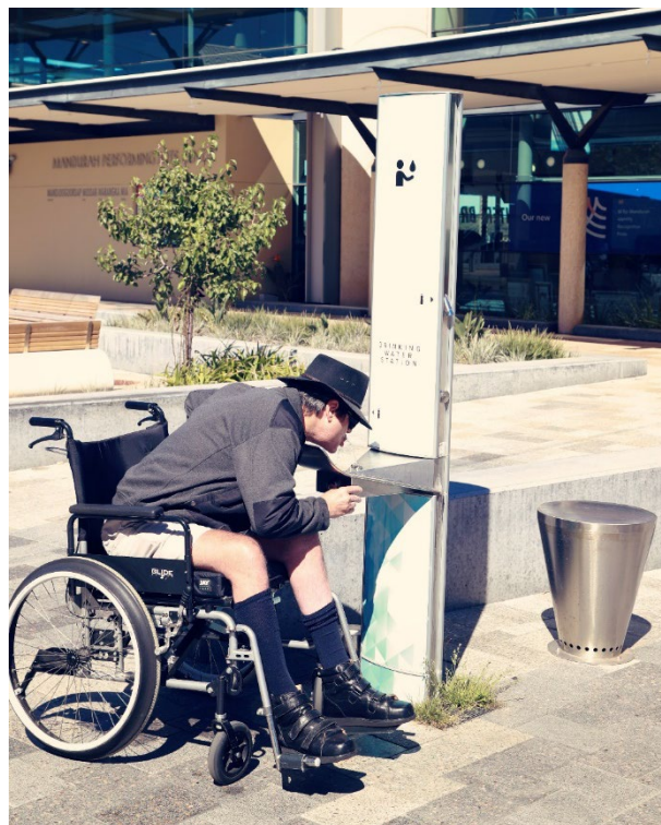
This is a photo of the drink fountain outside of the ManPAC.