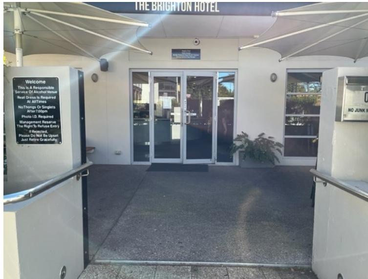
This is a picture of what it looks like at the top of the ramp.

I will go through the double doors to enter the space where the EasyBeatz event is being held. This area is called Charlie's Sports Bar. When entering this area there are tables, a dance floor and bathrooms to the right and the bar is to the left.