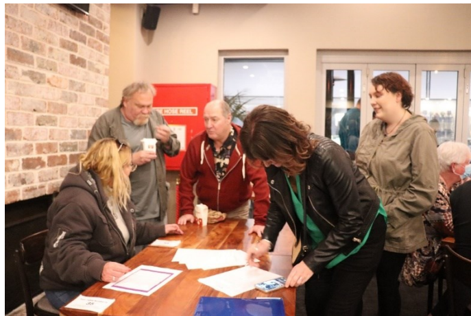
This is a picture of people signing into the event.

When I arrive at the EasyBeatz function I will provide my name to the people at the table so that can tick my name off a list. This is because there is only space for a certain amount of people at the event.