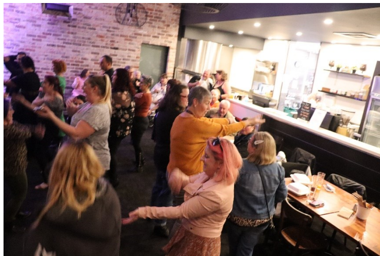
This is a picture of people dancing at the last EasyBeatz event.