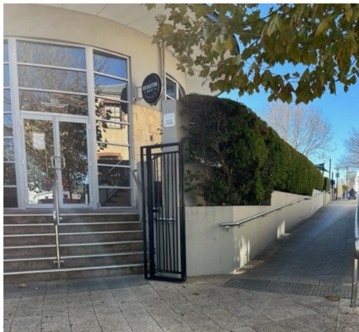
These are the entry steps.

At the top of the ramp I will arrive at an outdoor space which will have some tables and chairs. There may be people sitting at these tables and standing around having a drink.