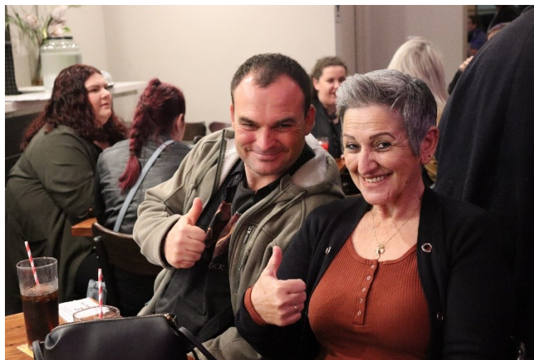
This is a picture of two people taking a rest from dancing.