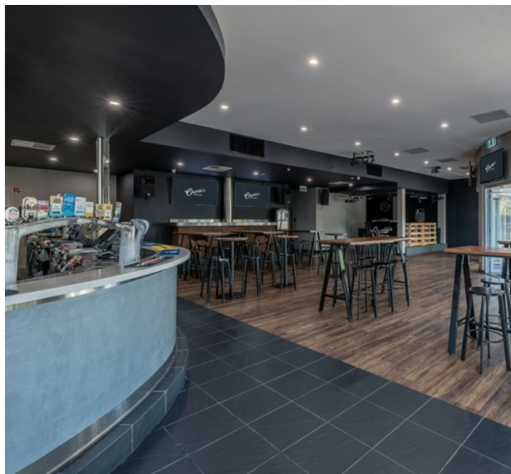
This is the Charlie's Sports Bar area, where the EasyBeatz event is being held.

I will go through the double doors to enter the space where the EasyBeatz event is being held. This area is called Charlie's Sports Bar. When entering this area there are tables, a dance floor and bathrooms to the right and the bar is to the left.