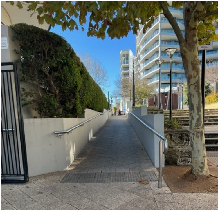
This is the ramp.