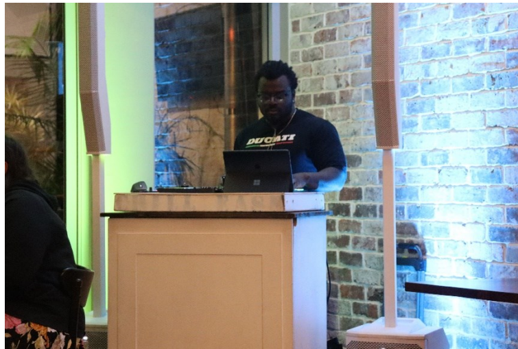
This is a photo of a DJ playing music at the Brighton.