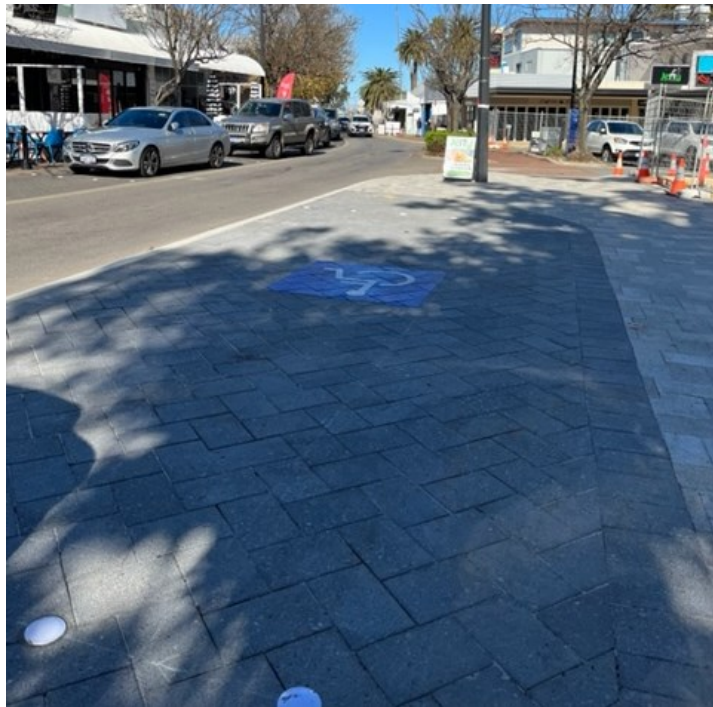
This is a picture of the extra-long ACROD parking bay, the street parking and the parking area across from the Brighton.