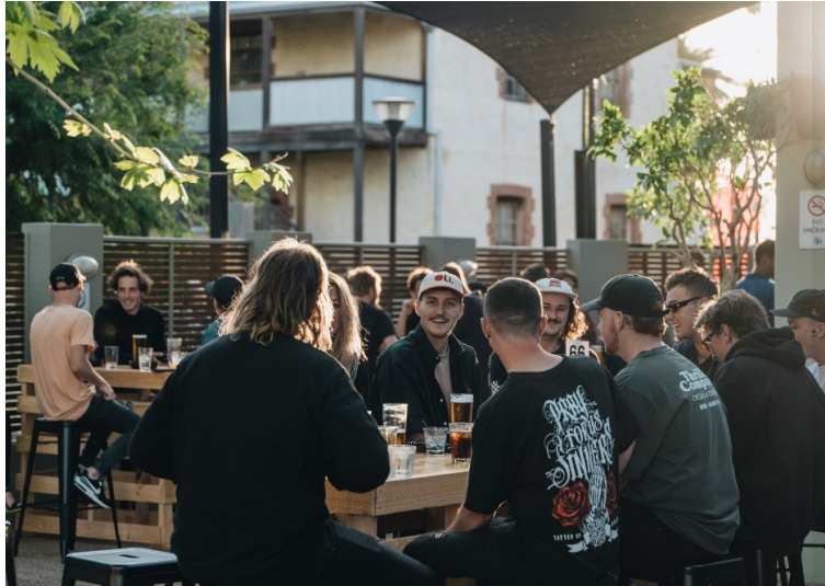
This is a picture of people sitting at bar tables at The Brighton.

When I arrive at the EasyBeatz function I will provide my name to the people at the table so that can tick my name off a list. This is because there is only space for a certain amount of people at the event.