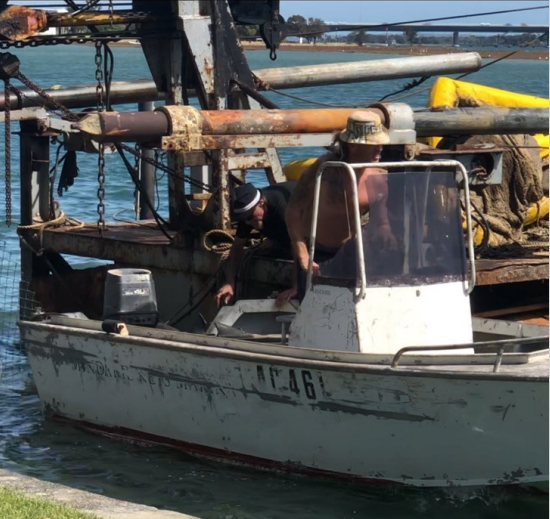
Top. Barge in Background, 2018.