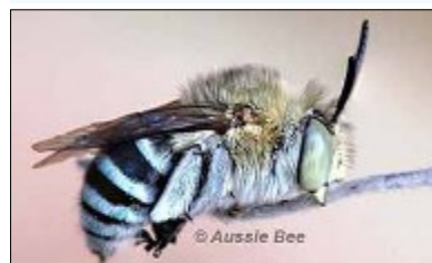
Photo of an Australian Native Bee