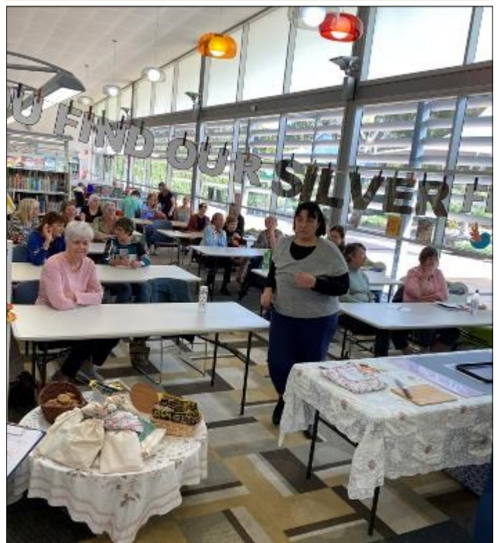
Photograph of the Beeswax wraps workshop held at the Falcon Library after the closure of the Museum.