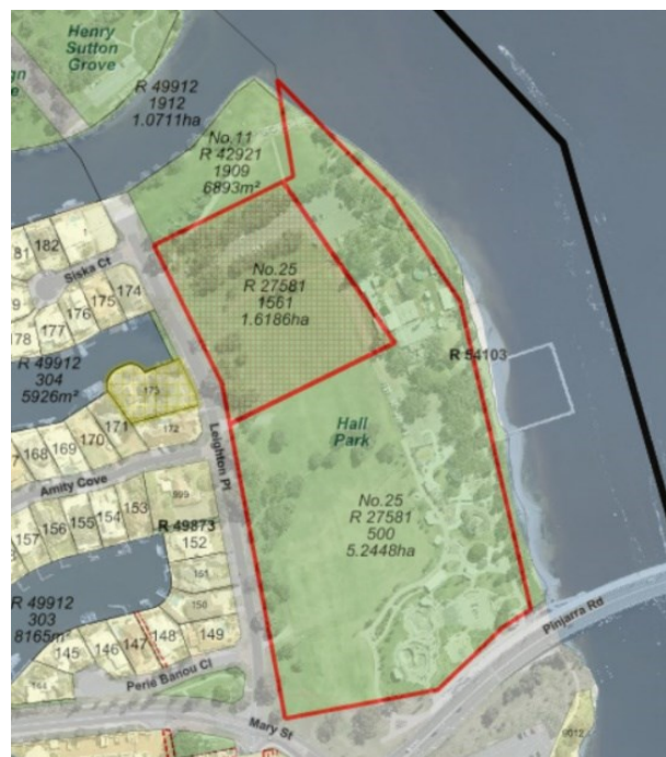
Figure 2: Intramaps

The skate park, play space, active reserves, parking, public toilets and lighting are all appropriate land uses within the conditions of the Management Order and do not require land excisions. This is in line with any other recreation reserve the City manages as public open space. However, note that the City has continued to engage with the State (through the Department of Planning Lands and Heritage) throughout planning and development of the Waterfront Redevelopment and Leisure Precinct master planning with regard to the development of public amenities and the proposed commercial development.