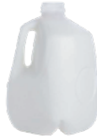
Plastic bottle and containers