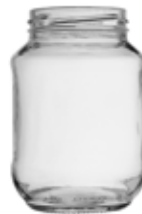
Loose items, rinsed & lids off